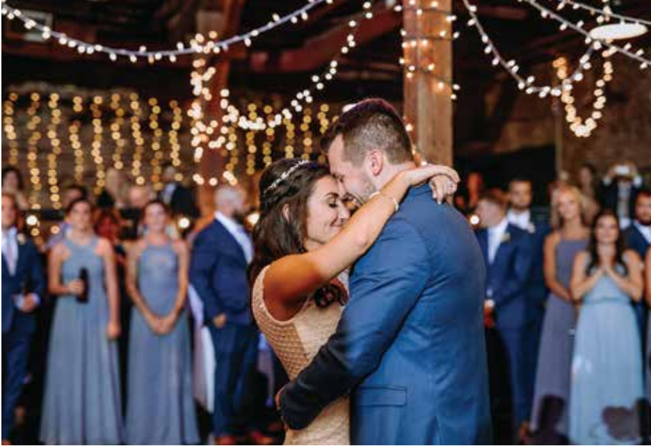
Cocktail style for up to 200 guests Reception seating with dance floor for up to 130 guests