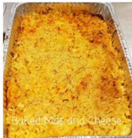
Baked Mac and Cheese

*Pulled Pork (with or w/o BBQ Please Specify add $2.00pp)