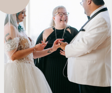
WEDDINGS WITH TRAVEL AND/OR REHEARSAL DINNERS